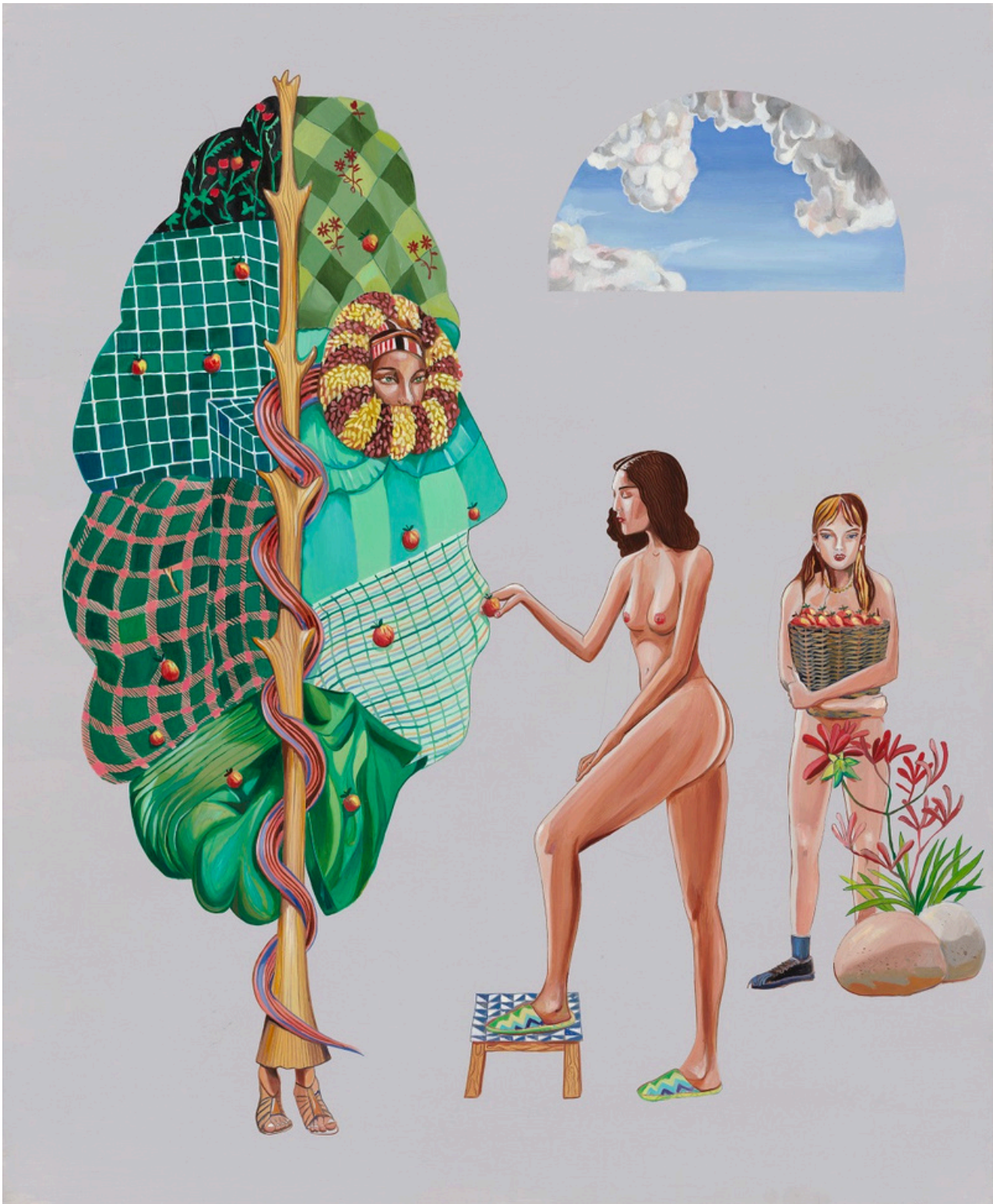
Rob McHaffie Fruit is healthy and snakes are misunderstood, 2025 oil on linen, 87 x 71 cm $8,000.00 (framed)