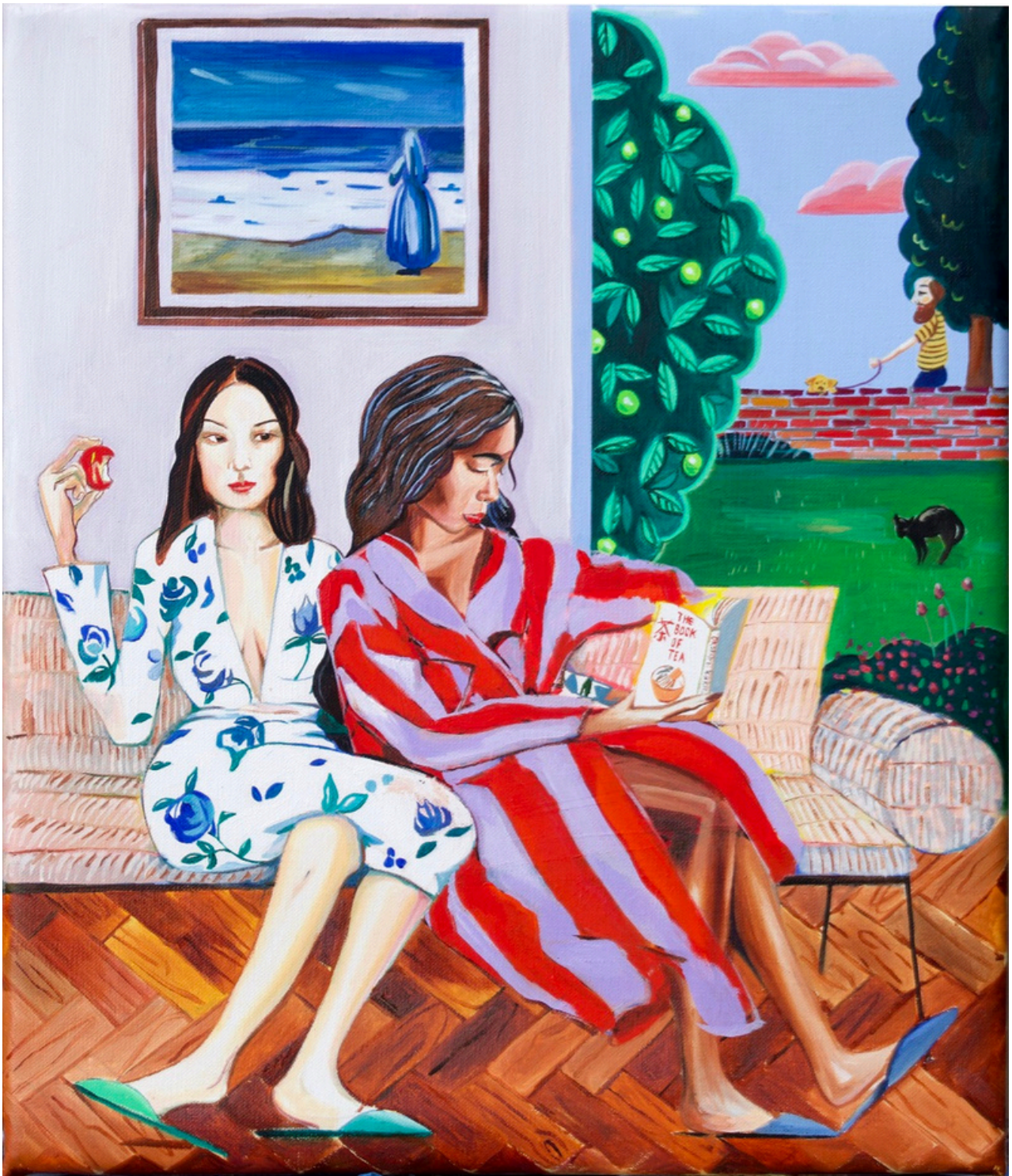
Rob McHaffie Do you think God is a boomer? , 2026 oil on linen, 33 x 28 cm $3,200.00