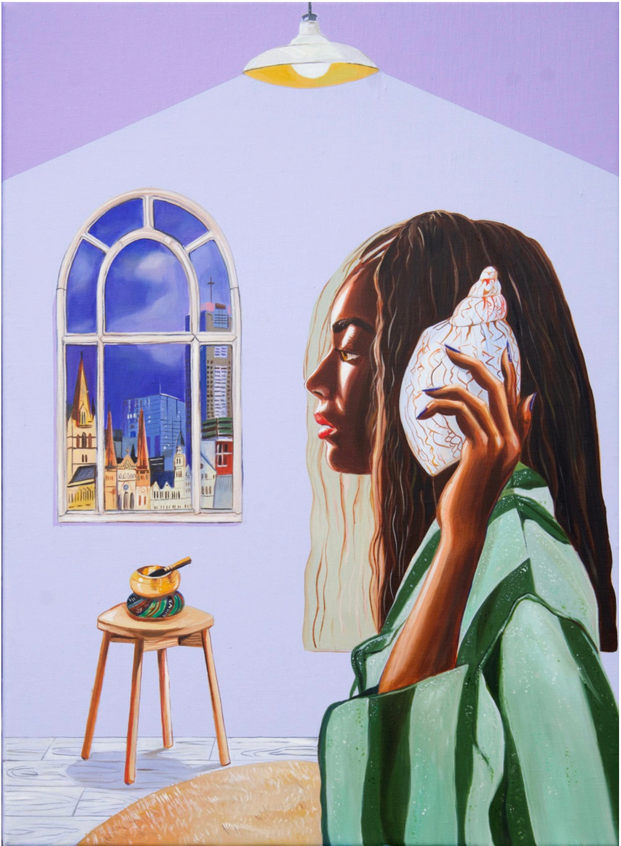
Rob McHaffie The sound inside a shell , 2026 oil on linen, 56 x 41 cm SOLD