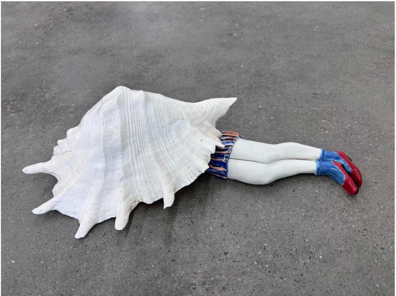
Rob McHaffie Designer shell , 2026 shell and porcelain 10 x 38 x 16 cm $950.00