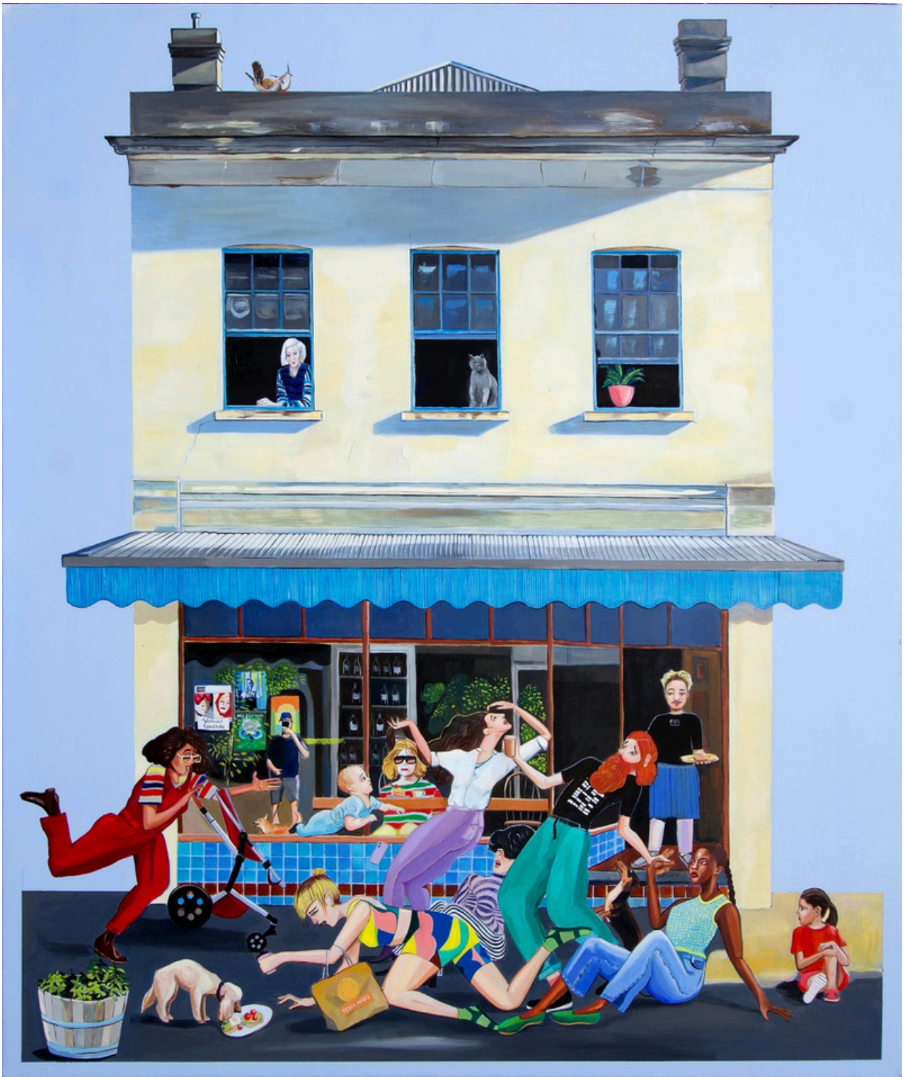
Rob McHaffie Collision on High Street, 2026 oil on linen, 122 x 102 cm SOLD