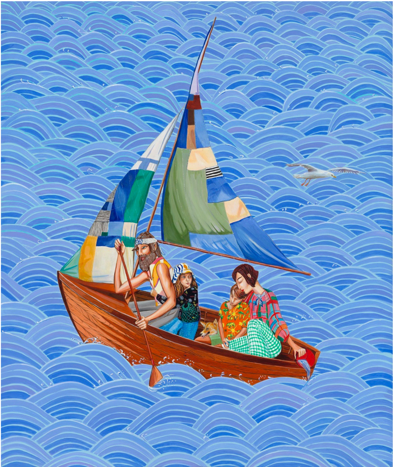
Rob McHaffie Young family hoping for some wind in their sails , 2025 oil on linen, 122 x 102 cm SOLD