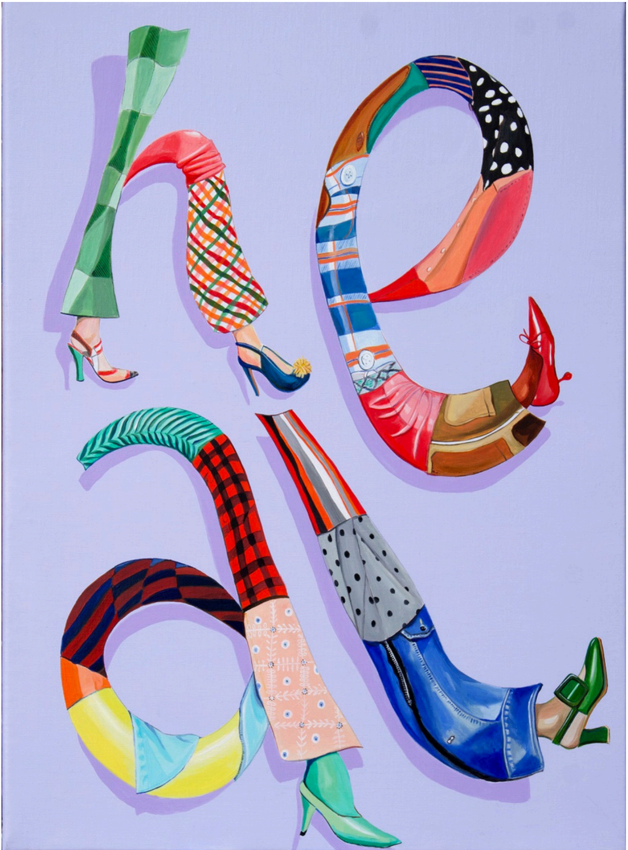
Rob McHaffie Heal in heels , 2026 oil on linen, 56 x 41 cm $4,950.00