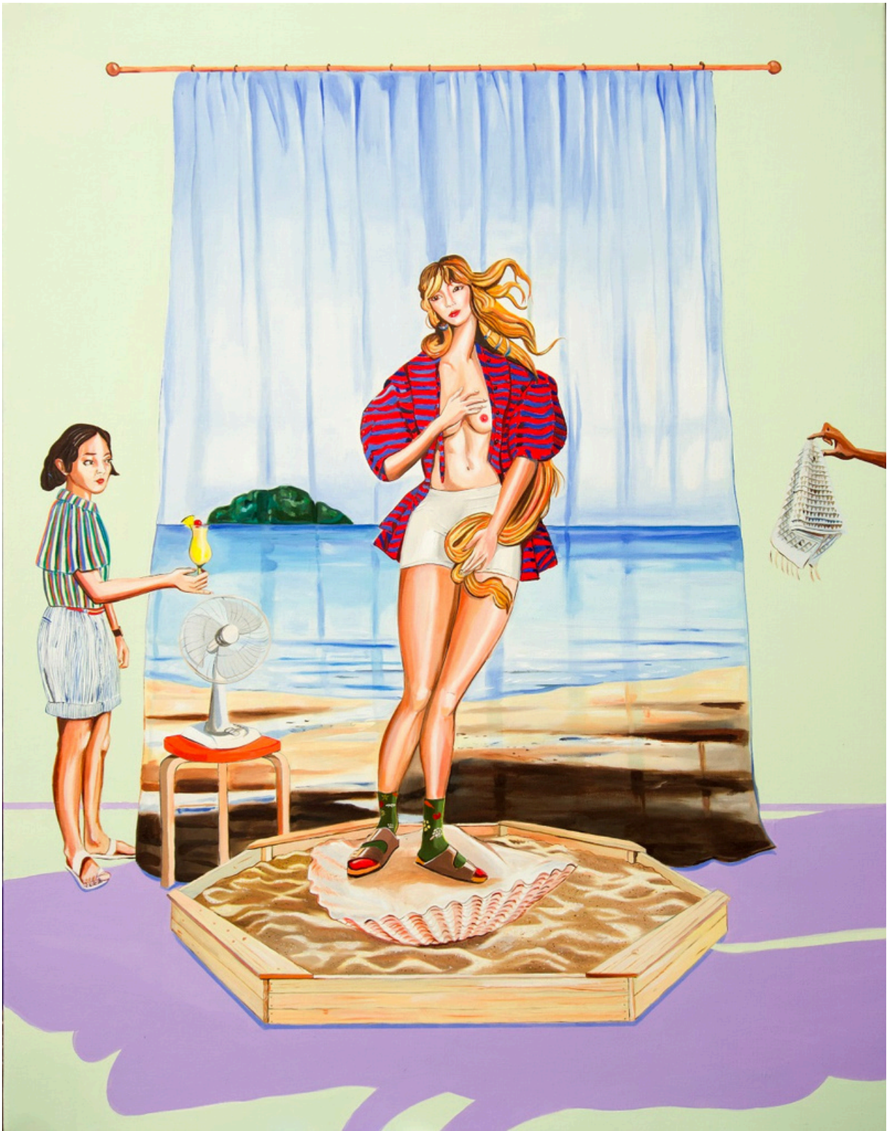
Rob McHaffie Staycation , 2026 oil on linen, 102 x 76 cm $9,500.00