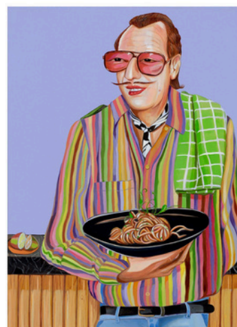
Rob McHaffie The cafe set, 2024 oil on linen, 9 paintings each 56 x 41 cm; overall 168 x 123 cm $25,000.00