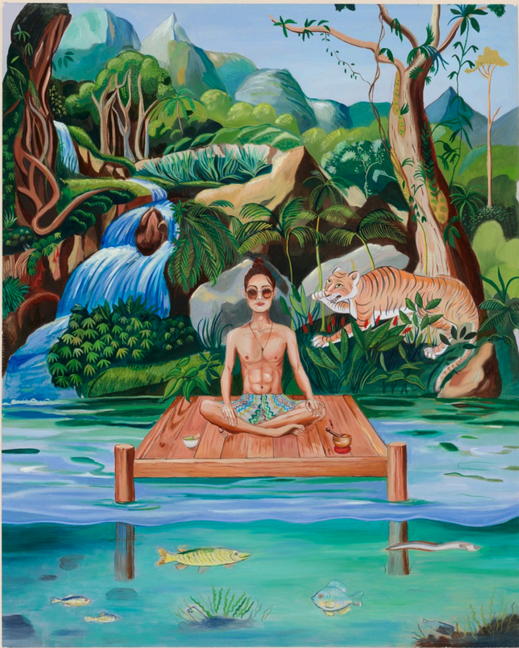
Rob McHaffie Longevity influencer attacked by a tiger, 2025 oil on linen, 87 x 71 cm $7,800.00