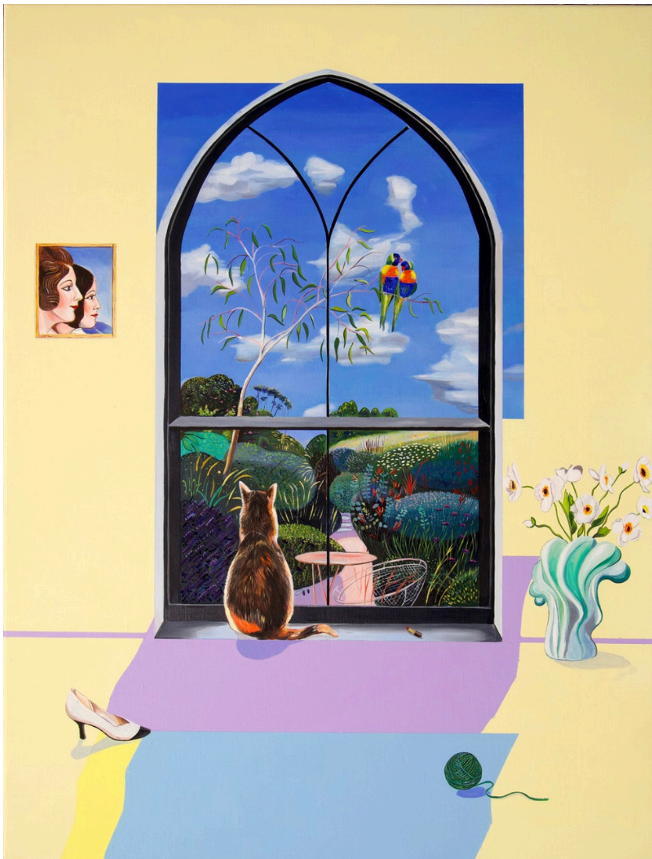
Rob McHaffie Have you fed Dot yet , 2026 oil on linen, 102 x 76 cm $9,500.00