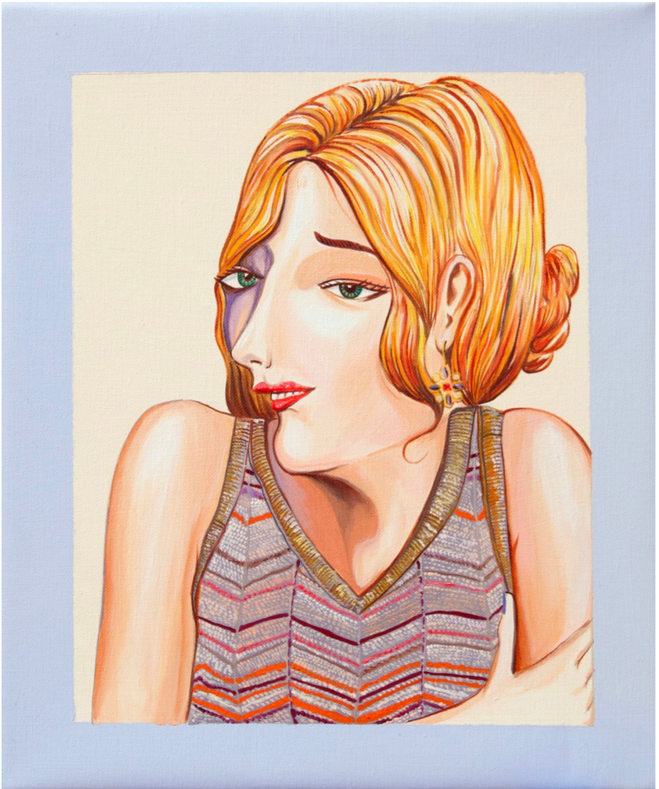
Rob McHaffie Cheeky lil smile , 2026 oil on linen, 28 x 23 cm $2,800.00