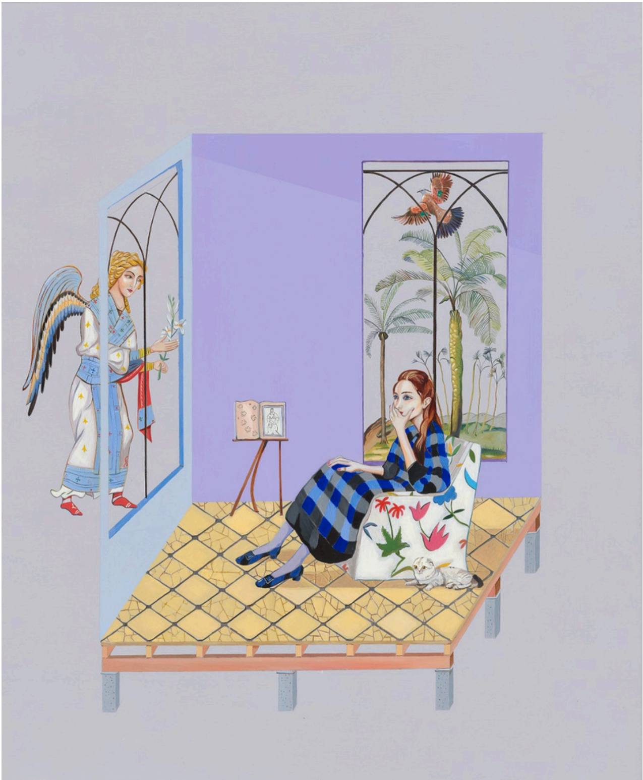
Rob McHaffie The Annunciation , 2025 oil on linen, 87 x 71 cm SOLD