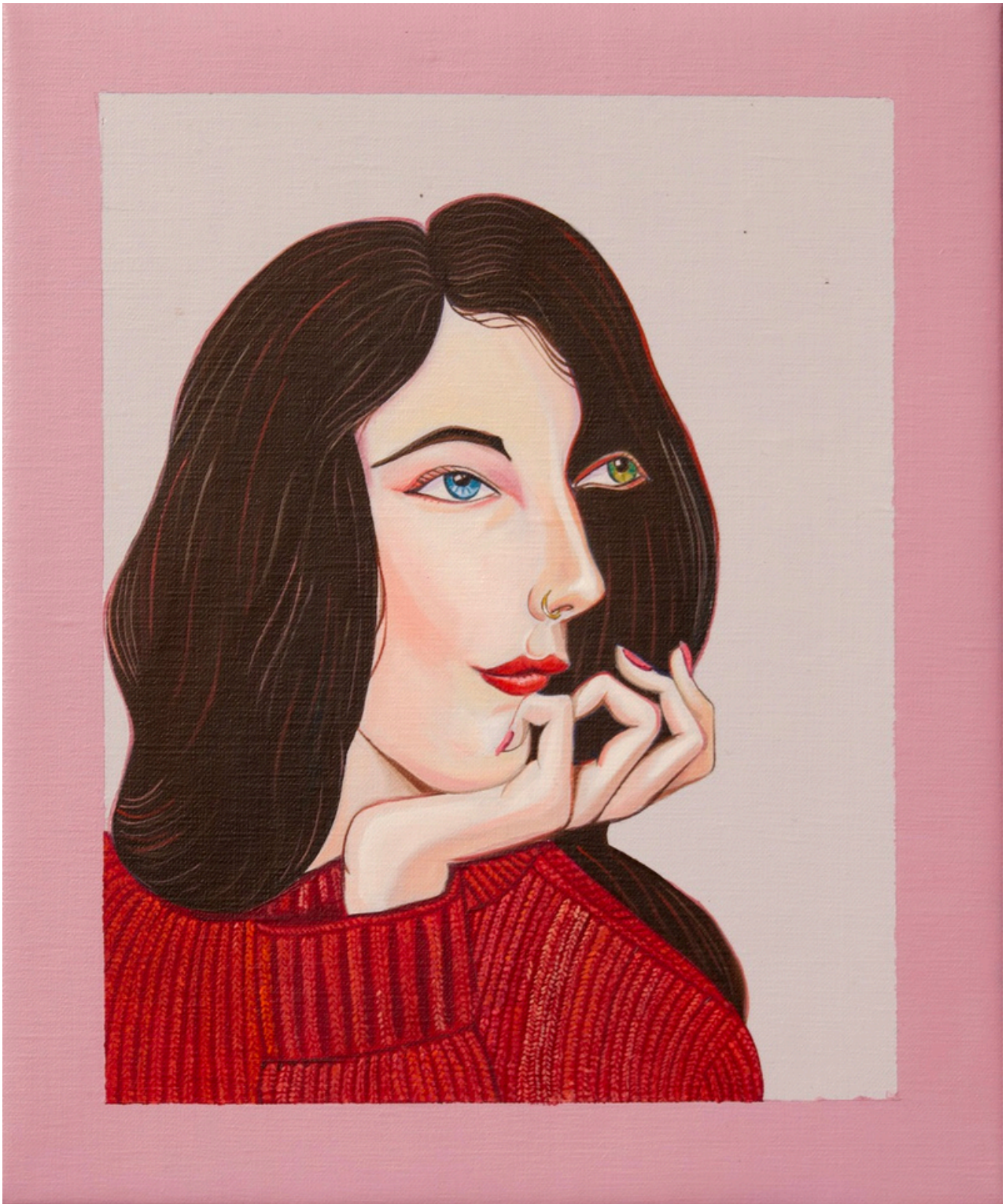
Rob McHaffie Permission to ponder, 2026 oil on linen, 28 x 23 cm $2,800.00